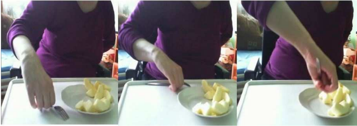
Fig.4. Patient with spastic upper limb while eating without the use of AKJ.

In neurological patients without progressive disease (e.g. stroke), long-term use of AKJ will have an improving effect while using cutlery (Fig.5). This will be the result of the effect of the described proprioceptive neuromuscular facilitation on the development of sensomotor disorders in the central nervous system (use of brain plasticity). Large number of repetitions = "modeling" of neural pathways. Assessing the improvement progress will be possible when the specialist separates the base of the AKJ from the wheel (possible disassembly) and then instructs the patient to use only the base with the attached cutlery during eating (without the wheel). Movement will then be performed in the kinematic open chain and if the patient performs it correctly it will be a sign of a considerable improvement. This is a functional test of the AKJ "Szermierz".