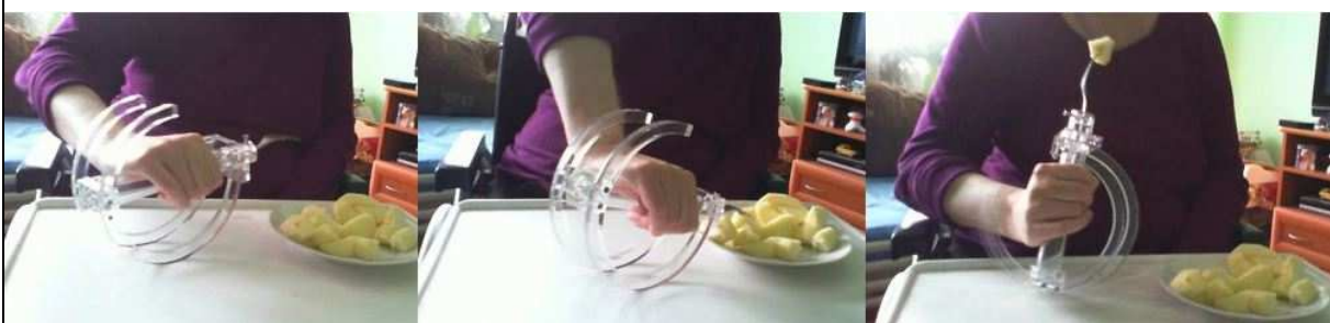
Rys.5. Patient with spastic upper limb while eating with the use of AKJ.

In neurological patients without progressive disease (e.g. stroke), long-term use of AKJ will have an improving effect while using cutlery (Fig.5). This will be the result of the effect of the described proprioceptive neuromuscular facilitation on the development of sensomotor disorders in the central nervous system (use of brain plasticity). Large number of repetitions = "modeling" of neural pathways. Assessing the improvement progress will be possible when the specialist separates the base of the AKJ from the wheel (possible disassembly) and then instructs the patient to use only the base with the attached cutlery during eating (without the wheel). Movement will then be performed in the kinematic open chain and if the patient performs it correctly it will be a sign of a considerable improvement. This is a functional test of the AKJ "Szermierz".