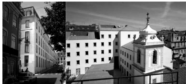
Fig. 3. Quarteirão Império – a transformation of quarter adjacent to Rua Garrett, design by Gonçalo Byrne Arquitectos 1994.

Simple bodies of the buildings, sparing in expression, have been finished with light limestone and blue ceramic tiles of the type of azulejos . 14 The articulation of the front elevations, with bands of shallow balconies at the level of the first and last floors, makes the complex subscribe to the neighbouring architecture. Inside the quarter, the shapes of buildings become more chiselled, benefiting from the play of light and shadow, white and blue, and various textures. Nevertheless, they do not constitute any competition for the neighbouring historic structures and displayed relics. Reference to history and tradition of the place, as well as respect for these values, is legible on various levels of the design. In the most direct sense (which doesn't require any interpretation of the phenomena observed), preservation of the structures – which previously existed here – shapes the architecture and enables them to be displayed in the best