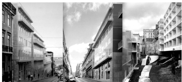
Fig. 4. Multifunctional complex Terraços de Bragança design by Álvaro Siza Vieira 2004.