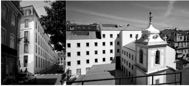
Fig. 2. Public square, viewpoint and public garage Portas do Sol in Alfama neighbourhood, design by Manuel and Francisco Aires Mateus 2005.

architectural structures, and the intangible one, referring to the sphere of impressions, memory and identity.