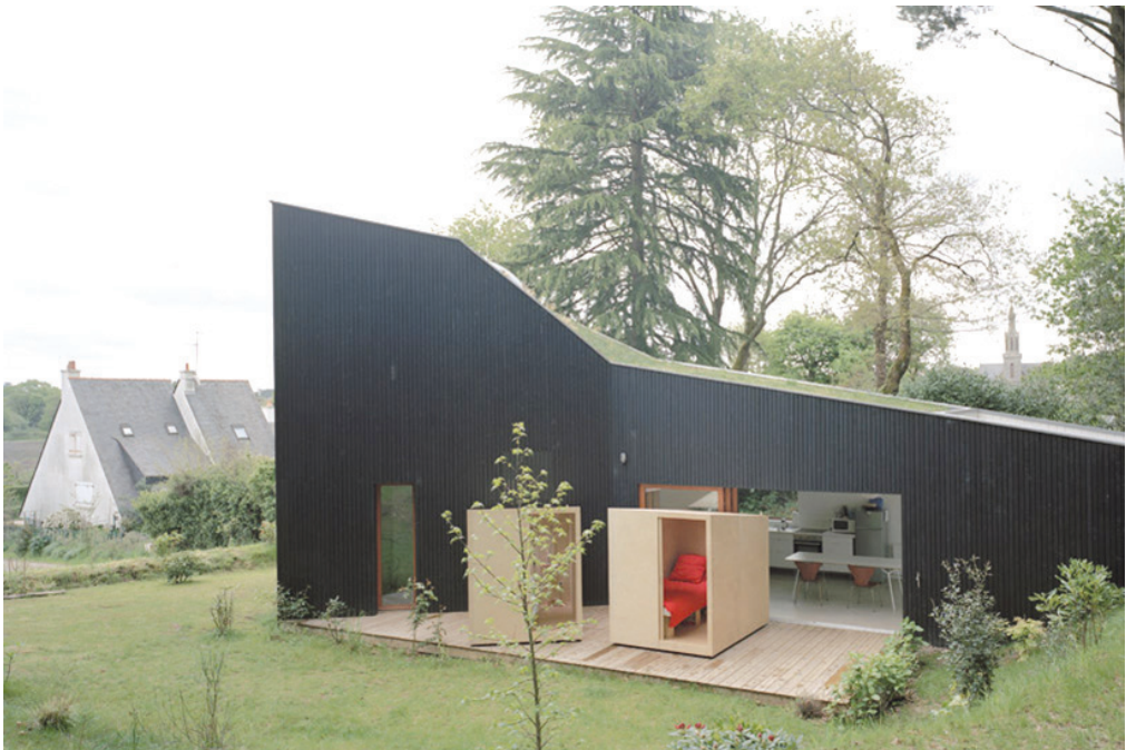
Fig. 3. Holiday home created by Raum architects.

Another way to transform the functional plan was found by architects from the French Raum studio. The building was designed and built in 2013 for a family with young children in the north-west of France. The building is divided into two parts. The first is a private part, while the second is a semi-private space, accessible from the outside through a large sliding balcony door. The ground floor of the building has an open plan and includes rooms in the living area: living room, kitchen and dining room. Next to the entrance to the house, there are mobile bedroom rooms, which if necessary or in the summer season are moved outside the building. This treatment allows