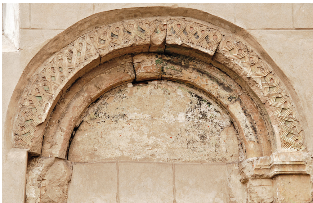
Fig. 4. Prandocin parochial church, an ornament on the portal arcade of the 12 th c.