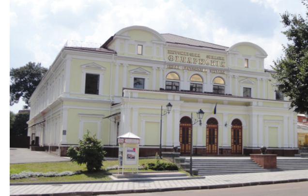
Ill. 2. Zhytomyr Regional Philharmonic named after S. Richter [16] Ill. 3. Polish House in Chernivtsi [19]