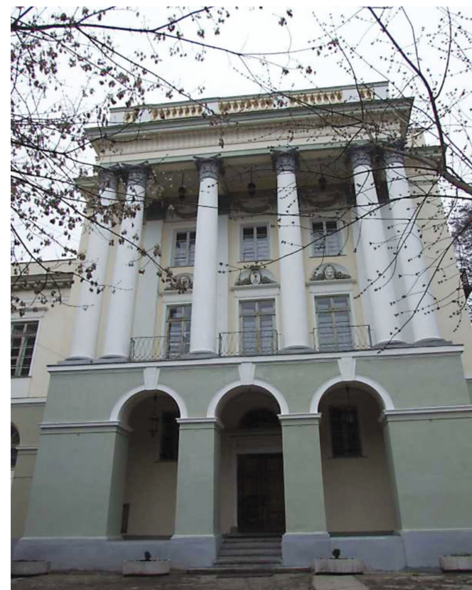
Ill. 1. Polish folk theater in Lviv a) facade; a) the plan; b) cut [23]