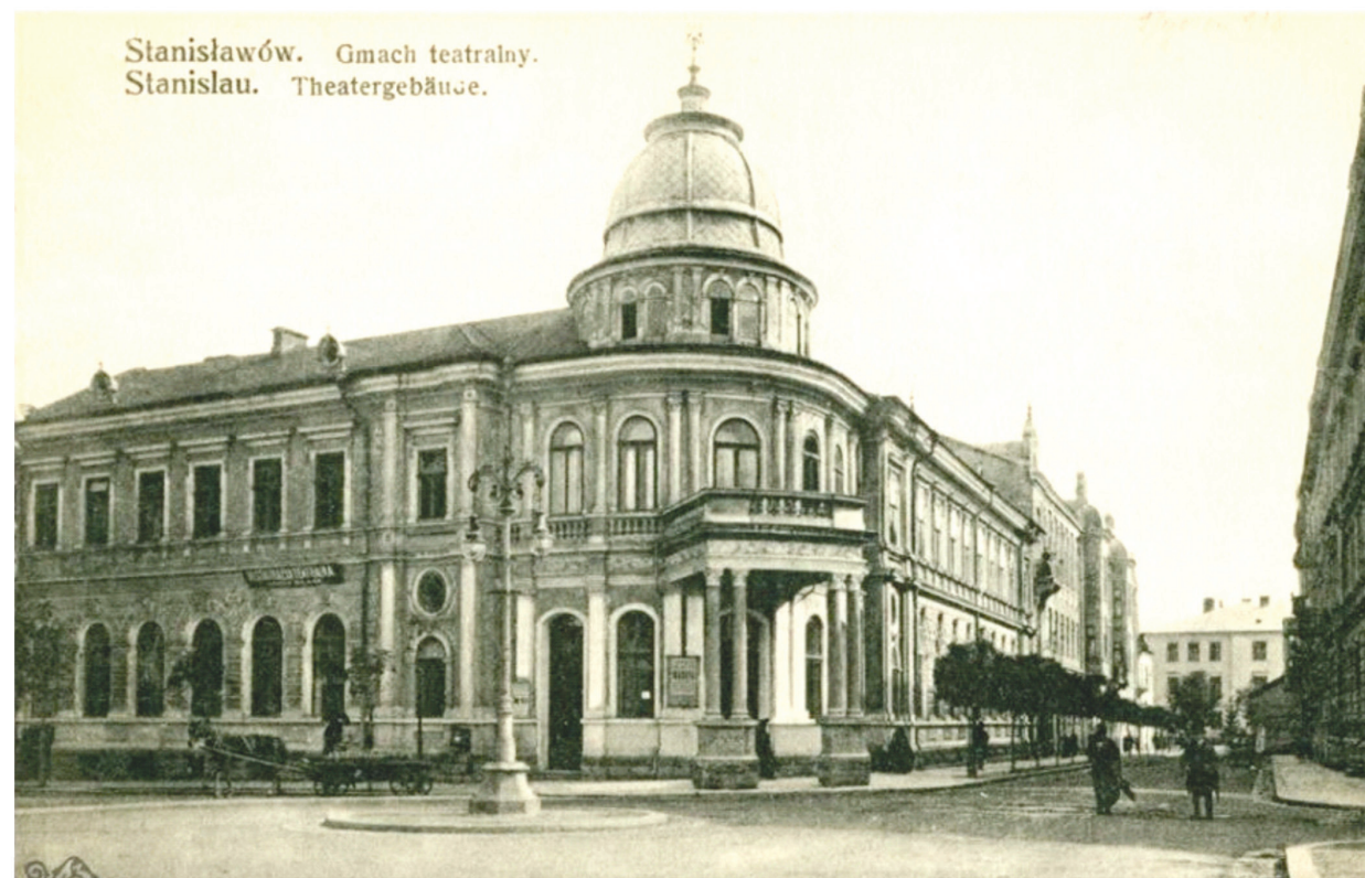
Ill. 5. Theater named after O. Fredro in Ivano-Frankivsk: a) a general view; b) a theater plan; c) the plan of the balcony [23]