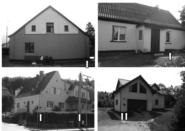
Fig. 1. Buildings tested for traffic-induced vibrations (arrows indicate the locations of vibration sensors)

In this study, the vibration field measurements taken on four residential buildings are presented (Fig. 1). The source of vibrations was related to the movements of vehicles with varying tonnages and number of axles, travelling at different speeds. For each building, a series of several tests was conducted. As the outcome of the tests, after the analysis in 1/3 octave bands, authors received about 400 results for each building. The peak values were selected and plotted on Dynamic Influence Scale I graph (DIS I). Fig. 2 and Fig. 3 show examples of graphs of peak accelerations with respect to the centre frequencies. After performing an analysis consistent