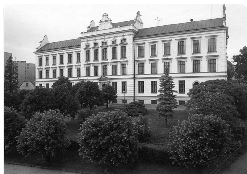
Fig. 2. Velké Meziříčí

Teachers of mathematics in Czech secondary schools, student-teachers or PhD students in history of mathematics can take part in the bi-annual seminar on the history of mathematics titled History of mathematics for teachers in secondary schools . Its main aim is to give them new information, sources, materials and examples to increase their knowledge so that they could improve and enhance their lessons and lectures with the historical aspects, be able