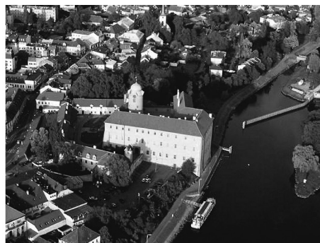
Fig. 3. Poděbrady