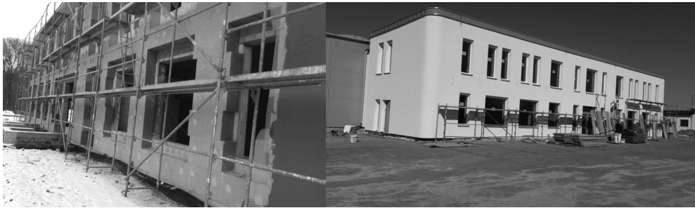
Fig. 1. Office building under construction as part of the EU project (PCBP)