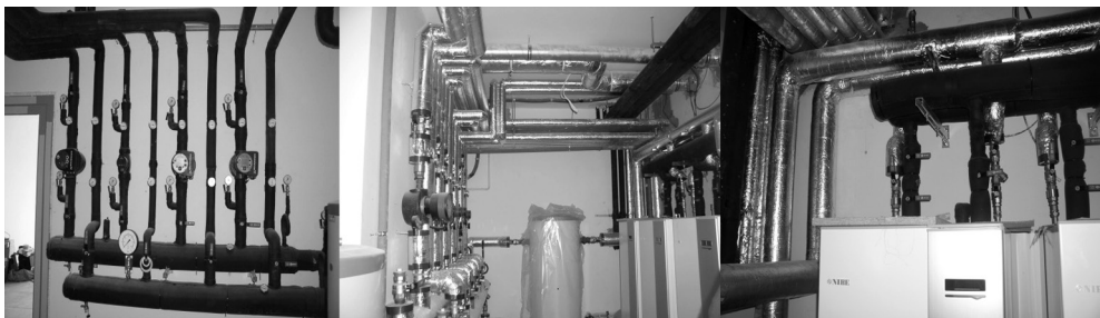
Fig. 2. Heating installations 4 heat pumps brine-water used for heating, ventilation and air-water heat pump for domestic hot water needs