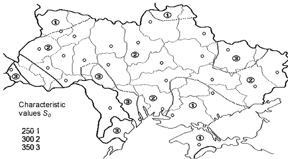
Fig. 3. The Ukraine territorial districting of the snow loading on cold roofs