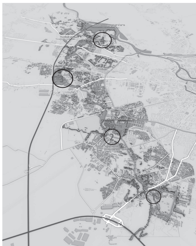
III. 4. The main areas of the Ślęza River Park as the elements of “emerald network” designated to the further development and connection by a system of biking and foot paths. Legend: 1) The hippodrome in the Partynice, 2) The Grabiszynski Park and planned community Mammoth Park, 3) The Millennium Park, 4) the Pilczycki Forest: a Special Area of Conservation (SAC) within the Natura 2000 network [7]. Graphic layout by Grzegorz Kasza

For each unit a separate inventory card was prepared (reviewing the various analytical aspects) and then subjected to various assessments aimed at establishing the optimum development option (protection and continuation of the current function or its transformation). This led to the creation of a rich database, which can be used for various purposes and the conceptual options proposed by individual groups are a source of inspiration for a civic discussion about changes in the next version of the Study. After completion of the analysis, each team presented its own concept of development of the entire area (III. 4). The concepts were supposed to include all the previously discussed ‘meeting places’ following the principles of sustainability.