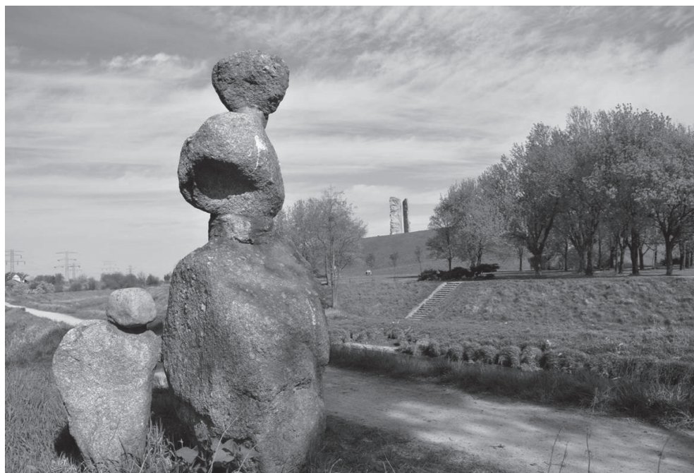
III. 1. The view from the proposed Śleza River Park and the community Mammoth Park with a sculpture by Tadeusz Teller

day Kozańów housing estate is situated) provided additional flood protection, similar to the Widawa River valley, which is used as a sort of a relief canal for the Odra. None of the later plans reflect such an in-depth understanding of the role of the rivers. Behrendt's plan assumed the construction of two new ports, which were to serve the industrial zones to be developed along both banks of the Odra. Together with the city port, established in 1897, and two river shipyards, they formed a dense waterway infrastructure, located some distance from the city centre. Two hydropower stations, erected under Max Berg in the years 1924–1925, created the only interference with the old cityscape.