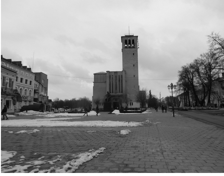
il. 2. Town Sokal in Lviv region. Pedestrian area in the downtown

pedestrian traffic, it is possible to provide several tourist routes each with its own subject, instead of one observation site to provide several equivalent ones, and to spread the attractive objects on the territory of the town and outside it. Under conditions of a small town, the solution of such problem is more real, as its architectural space is visually whole and there are more equivalent places for its observation. Besides, all the parts of a small town are accessible to pedestrians, which makes it possible to offer a large number of variants of observation routes.