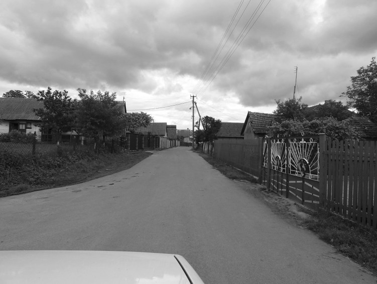
il. 4. Town Velykyj Lubin in Lviv region. Lack of pedestrian communications along the roads (personal archives of the author)

architectural and archeological monuments, natural exotics etc. Common residential streets should be also included into the general pedestrian net. Mainly they combine on their small space the functions of traffic lane, bicycle lane, and pedestrian path, in smaller towns he function of road for domestic animals and foal is added. In spite the fact that the majority of the population goes within a town by foot or by bicycle, the town streets except for central districts do not have pavements and combining the role of pedestrian communication and vehicle transit [il. 3, 4]. Such a situation with a transport network was inherited since the times when the cars were big rarity. Besides, lots of small towns have received their town status relatively lately and for a long time they had been villages with appropriate demands to the organization of their transport network.