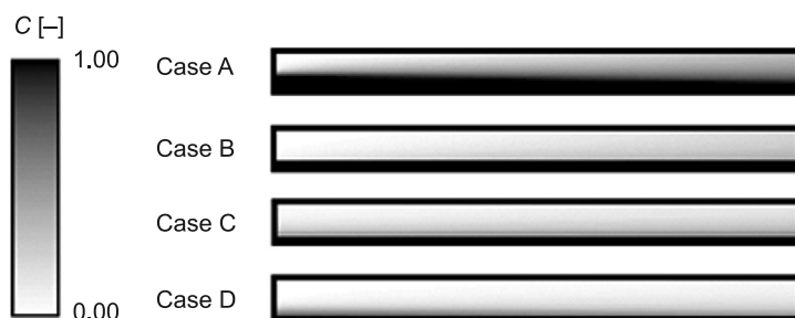
Fig. 2. Dimensionless concentration C of soybean oil in \text{scCO}_2 in the extraction module (solvent mass flow 0.5 g/min)

In Figure 2, dimensionless concentration C profiles for one flow rate and for the four cases A, B, C, and D of the extraction process (showing the progress of the cleaning process) are depicted (not to scale). As mentioned before, the saturation decreases significantly as the cleaning process advances. Moreover, as can be noticed in Figure 2, soybean oil concentration at the membrane surface changes in axial direction and mass transfer rate depends on the axial coordinate ( \text{scCO}_2 is being saturated while flowing through the module). The membrane is cleaned unequally and will already be clean near the extraction module inlet while it will still contain soybean oil in other regions. Hence, the process will be described more accurately, if the assumption of parallel movement of the oil-SCF phase boundary will be rejected and a dynamic phase boundary capturing approach using the volume of fluid method will be used instead.