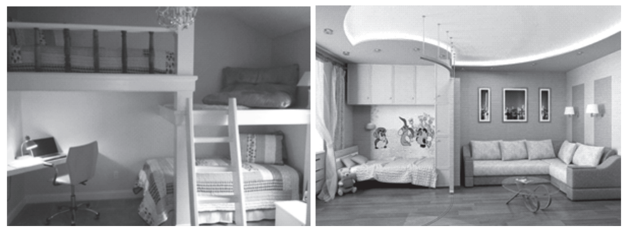
il. 1 Child space within: a) flat: http://www.liveinternet.ru/tags_b) room: http://furniturelab.ru/kak-obustroit-odnokomnatnuyu/

An important role in shaping the child's living space plays parents who are arranged at their discretion, equips, determine the child space within an apartment or house. Architects effect on space within the limits of the apartment comes down to valuation areas that should be allocated per person regardless of the age, but does not require it to submit. Due to the housing problem in Ukraine (85% of the urban population is not able to improve their living conditions) [7], often this space is minimized.