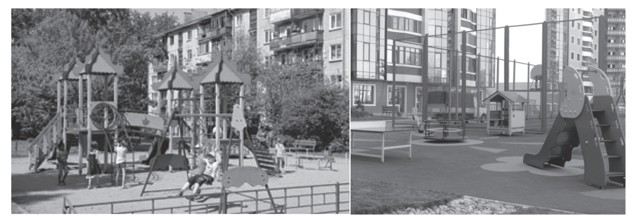
il. 3 Kids space within the city houses adjoining organized: http://www.sibdom.biz/articles/Pridomovaya_territoriya_Dvor_novogo_pokoleniya/, http://www.odome. kz/stati/uyut-vozle-doma/

During socialism, in Ukraine were built many facilities for children (kindergartens, schools, palaces of Pioneers, etc.) for mass collectivization. It had its own ideology, which is laid down by adults at the time. For this reason, most objects do not become popular and in the period of Perestroika (1985–1989rr.) were destroyed.