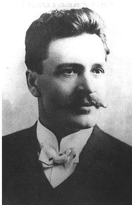
Fig. 2. Ignacy Mościcki, Freiburg 1907

Mościcki's activities in Switzerland were marked by successes but the work atmosphere did not always allowed freedom and the necessary effectiveness of research. This was due to crossing of scientific ambitions and financial interests of factories, a phenomenon typical for the field of technology. It happened many times that Mościcki, forced by circumstances, sold his ideas – they were not fully elaborated at the time – to different firms, receiving only small sums of money in return. The purchasers implemented a given idea and put appliances on the market after having given them various commercial names. This was the reason for the squandering of many valuable inventions of Mościcki. Today little is known beyond the fact that these inventions should be traced back to him.