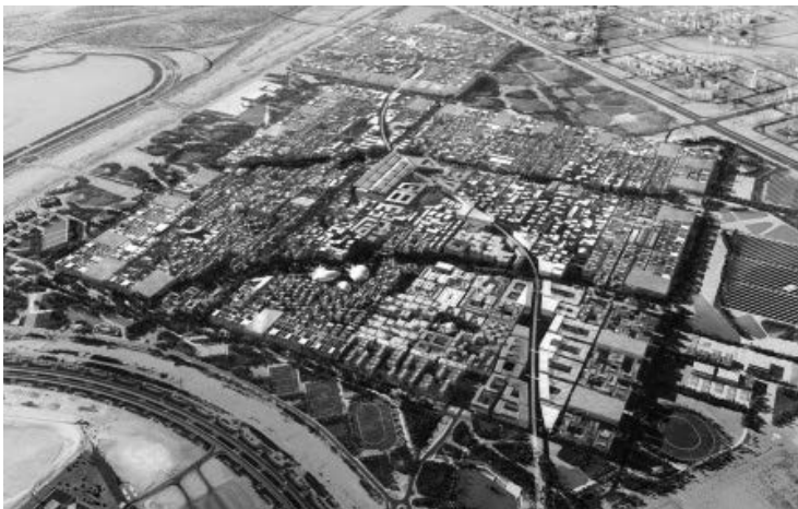
Fig. 6. Masdar – bird’s-eye view

The Clay Fields project showed exactly how important the education of users is. It is a passive social housing estate, the main objective of which is to assume a low cost of construction along with the use of biodegradable materials found in the vicinity of the construction site. This minimizes transport costs and also reduces the production of emissions. As for the residents, they were carefully instructed when to open the selected windows and in what order to minimize heat losses while ventilating. Indeed, the proper use has allowed reducing operating costs appreciably. And this is still merely a passive house.