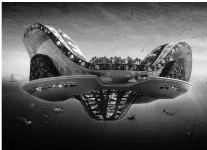
Fig. 3. A model of the Lily Pad floating complex

Thus, it became necessary to find a solution that would allow builders independence from soil. As it turns out, this was not that difficult. Based on the fundamental laws of physics, it was possible to create the first floating structures, which incidentally have also been established in Poland. Unfortunately, Polish construction law remains a problem because of the lack of foundations, which are an integral part of the design. Meanwhile, floating homes are already being created on a large scale in the Netherlands, where not only are they popular, but there are also areas in which no different type of buildings can be erected. This primarily involves all kinds of flood zones, located along the major rivers and lakes. In case of an emergency situation or a flood, the house just drifts in place, safely anchored to prevent it from floating away.