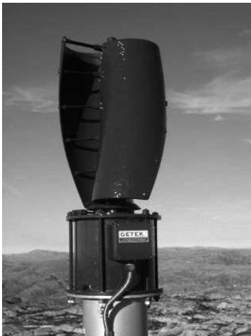
Fig. 1. An example of vertical turbine

until now (Fig. 1). The large tracts of flat industrial roofs, which generally are placed on open spaces, are particularly promising. Moreover, the weight of such turbines means they can also be mounted upon light structures, and the amount of electricity produced in this manner may be sufficient to power lighting. They are very efficient, use magnetic bearings and pose no threat to birds.