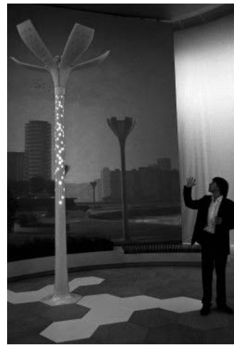
Fig. 2. Philips Blossom lamp

However, there are more possibilities. Philips has developed a design for Blossom smart solar lamps, also equipped with wind turbines (Fig. 2). This type of element can decide whether it is able to get more energy out of wind or the sun, and adjusts to the most efficient position. Moreover, the use of LED lamps led to a significant reduction in energy consumption at night, when they have the task of illuminating the streets. The special paving, which generates energy by pressure, is also noteworthy. Installing these panels around a bus or tram stop can produce sufficient electricity to light it through the night. Savings will be enormous, given the amount of such shelters exist in each major city.