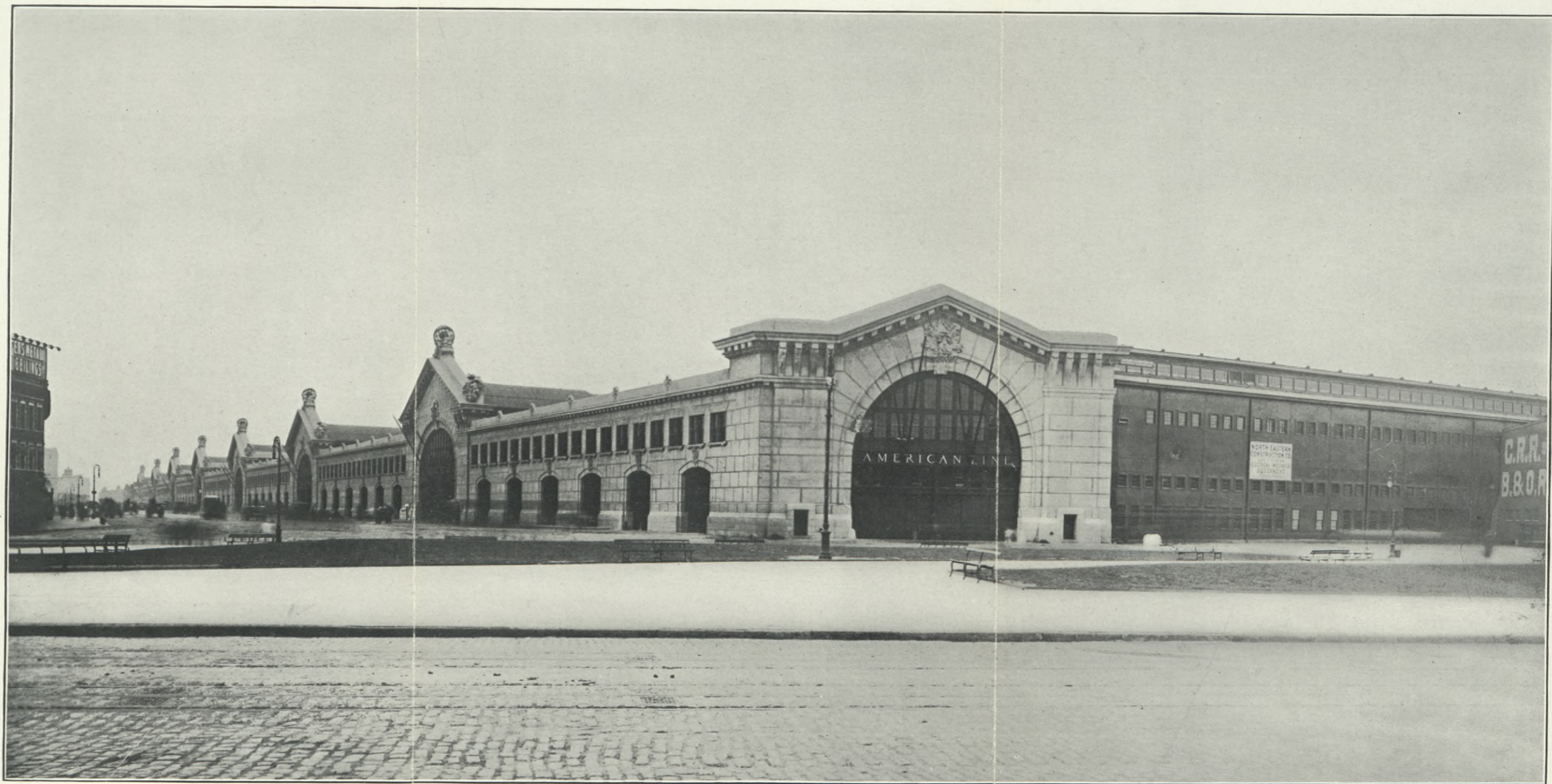
CHELSEA IMPROVEMENT, LOOKING SOUTH FROM WEST 23RD STREET, NORTH RIVER.