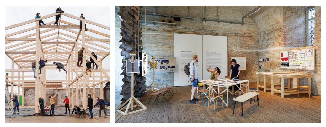
Fig. 1. Assemble during the implementation of the Yardhouse project, photo by Assemble / Exhibition – How We Build at The Architekturzentrum Wien in Vienna, photo by L. Rastl (reference: https://www.azw.at/en/event/assemble/)