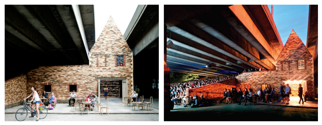
Fig. 4. Assemble, Folly for a Flyover, photo by Assemble [8]

The popularity of the project encouraged its authors to consider another analogical implementation, using another type of unused space. This time it was the space under a viaduct that was selected.