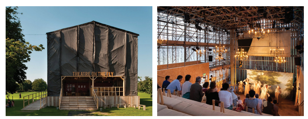
Fig. 6. Assemble, Theatre on the Fly, exterior and interior, photo by J. Stephenson [9]