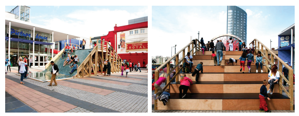
Fig. 8. Assemble, The Big Slide, photo by Assemble [10]

An important element of the idea of sustainable design was the use of recycled materials or the use of such materials that could be processed easily. Some of them were donated to the authors of the project for the purposes of construction. One example is of a material that covers the wooden frame of the construction. It turned out that the semi-transparent fabric, which is usually used in the construction of ponds or as a foundation for road surfaces, ensures great sound insulation, even in the case of the wind blowing [9].