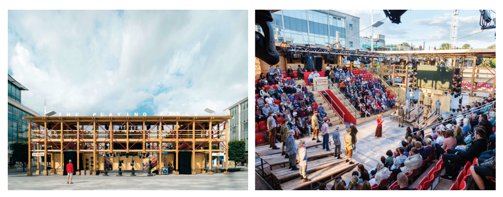
Fig. 9. Assemble, The Playing Field, exterior and interior during the play [11]

A large wooden structure was established vis-á-vis the Theater Royal. The construction was two-sided. On one side there was a wide ramp of slides, and on the other, stairs were built, which apart from providing access to the slides, served as the auditorium for theatrical performances. The surface of the slide was covered with plywood with a laminate imitating marble, giving the whole piece a light-hearted effect [10].