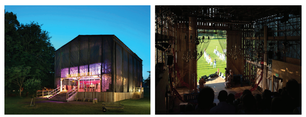
Fig. 7. Assemble, Theatre on the Fly, building at night and interior during the play [9]

The facility was located in a derelict area near the existing Chichester Theater and it was supposed to refer, with regard to its function, by means of traditional and innovative elements, both to the latter as well as to history of the theater. A unique detail was, for example, wide double-leaf doors that open the stage to the meadow. The internal space was to reveal theatrical technology to the viewer, by exposing technical mechanisms that usually remain invisible, e.g. by exposing the machine room of the stage tower.