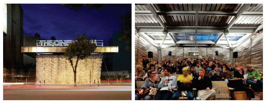
Fig. 2. Assemble, The Cineroleum, photo by Assemble [7]

A significant subject of Assemble's activity is related to temporary architecture, because the collective considers it as the area which enables quick and effective introduction of its philosophy into life. Their opening project was the construction of a temporary scene at an abandoned gas station.