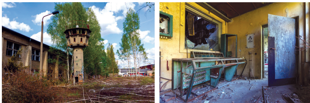
Fig. 1. Former airfield in Johannisthal. The place is a subject of interest of photographers and graffiti artists

During the First World War the airport in Johannisthal was used by military and for aircraft production. In 1912 the German Experimental Institute (DVL-Deutsche Versuchsanstalt für Luftfahrt) was established and the airport became an important place where research was conducted. 1919 was very significant for the airport history too, because then the Deutsche Luft-Reederei (German airline, Lufthansa’s predecessor) began its first post and passenger flights there. Passenger traffic was moved from Johannisthal to Berlin when the new airport