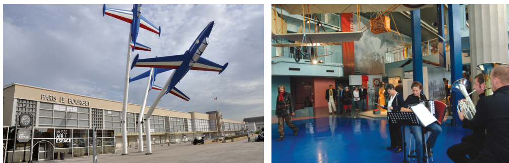
Fig. 4. Air and Space Museum in Paris