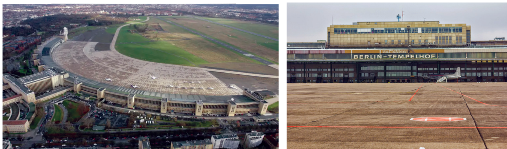
Fig. 3. Berlin-Tempelhof Airport a bird's-eye view and facade of the terminal

In 2009 a competition for the adaptation of Berlin-Tempelhof airport, whose terminal building has been protected from 1995, was announced. The former airport became the subject of many works. Although the projects differ a lot, a linking element in these conceptions could