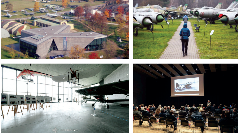
Fig. 5. Polish Aviation Museum in Cracow

former airport was gradually built up, and new residential and service buildings were built there. A landing strip on the side of the airport which hadn't been built up was created, and then, in 2010, a new, main building of the museum was opened. In this modern object a rich display of aircraft is presented. This place held both museum and educational functions. In December 2018, the Polish Aviation Museum in Cracow was highlighted as one of the 20 best museums of aviation in the world [21, 32, 35].