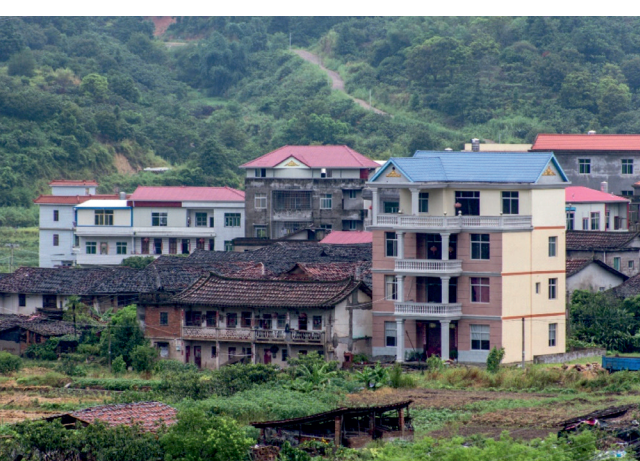
III. 6. A recently built house in avillage on Fujian Province. Example of box-a-like "villa." Source: picture by the first author (July 2017)