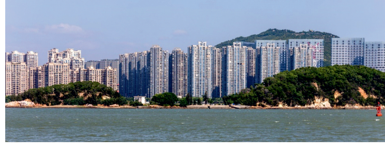
III. 1. Xiamen 2018 (Fujian Province). Picture by the first author