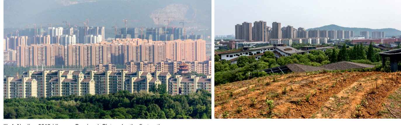
III. 4. Nanjing 2018 (Jiangsu Province). Picture by the first author III. 5. Hangzhou 2018 (Zhejiang Province). Picture by the first author

public design institutes to propose pilot projects or providing fundings for bottom-up applications by local authorities. The main goal, at the present stage, is to realize aconspicuous number of demonstration projects to cover the largest spectrum of possible strategies of rural revitalization, from which to learn and be inspired. The campaign is seeking the improvement of the rural environment, mainly promoting urban living standard in the countryside, especially through the beautification of public spaces, the strengthening of sanitary infrastructures, the reorganisation of settlement's schemes and the supply of services to support entrepreneurial innovation.