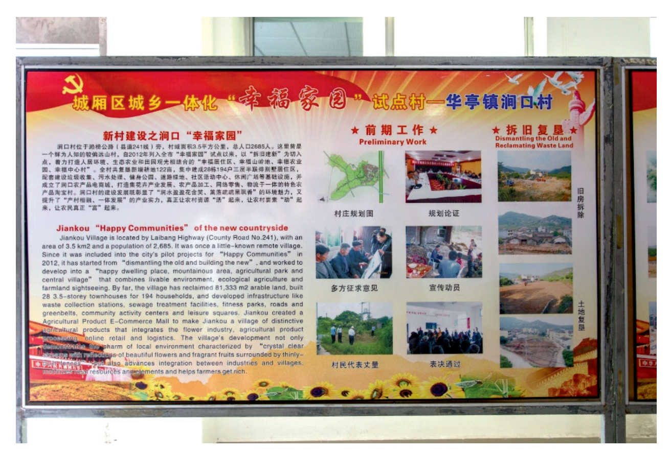
III. 7. Introductive panel of Jiankou Happy Communities. Source: picture by the first author (August 2017)

III. 8. Introductive panel of Jiankou Happy Communities. Source: picture by the first author (August 2017)