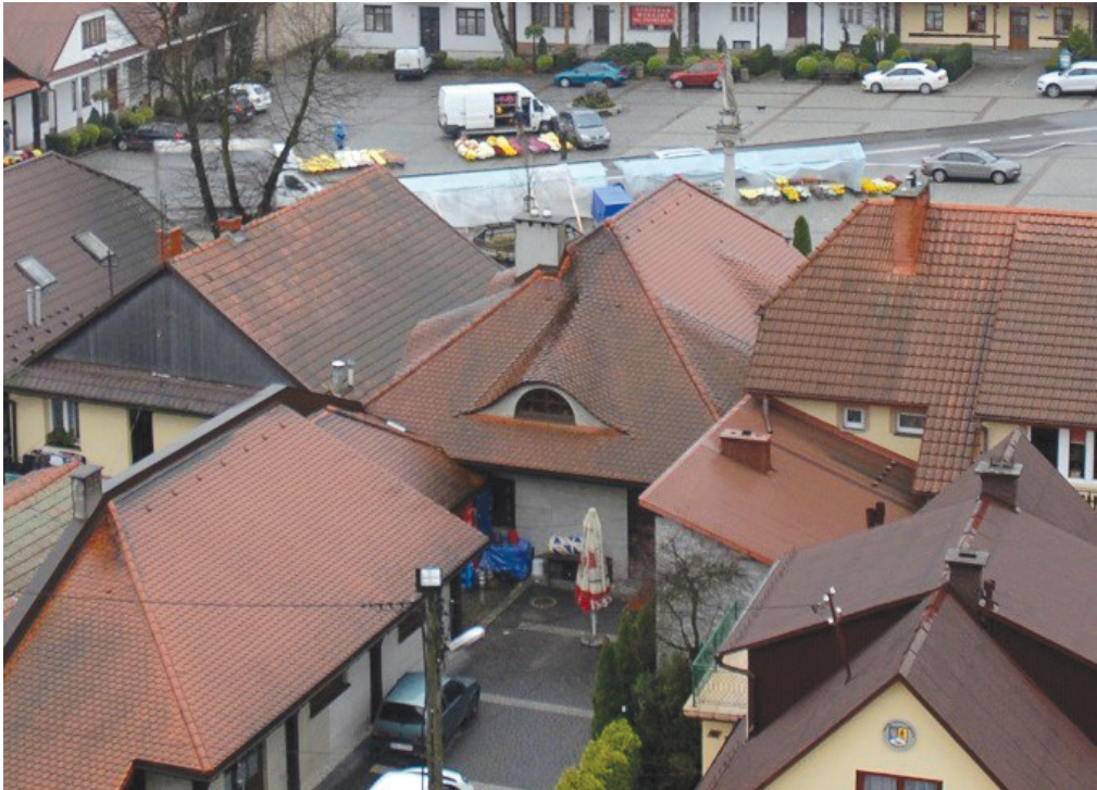
Fig. 8. View of the historic houses near market square in Lipnica Murowana nowadays

Besides the already mentioned well-known historic structures located in Lipnica Murowana, valuable relics of former housing can also be found in this former town. They are one-storey houses from the turn of the 20 th century, typical for small, historic towns [10]. Unfortunately, most of them are in poor condition and are gradually falling into disrepair. They certainly require better conservation protection and restoration, as well as listing in the county heritage register. The latter remark refers primarily to the houses surrounding the market square, and those located within the mediaeval urban layout (no: 106, 142, 34, 113, 108, 145, 132, 76 and 134). It is also suggested that selected utility buildings reflecting the agricultural character of the village be protected as well [11].