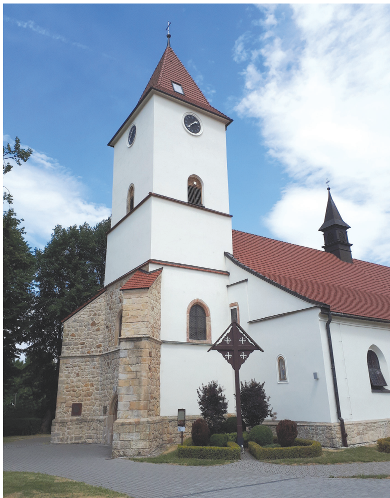
Fig. 3. View of the parish church of St. Andrew the Apostle in Lipnica Murowana nowadays

There is one more historic church building in Lipnica Murowana. This is the Baroque church of St. Simon. The building was founded by Stanisław Lubomirski, the Starost of Lipnica, in 1648. The church might have been erected on the site of the family home of St. Simon of Lipnica as a votive church. The building has one nave and a gable roof with a little bell turret. At the entrance, there is a bell-gable, and in the vicinity there stands the statue of King Władysław Łokietek, the founder of Lipnica [9, 10].