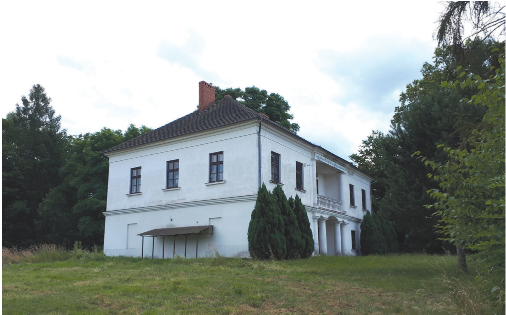
Fig. 6. View of the Ledóchowski Manor in Lipnica Murowana nowadays