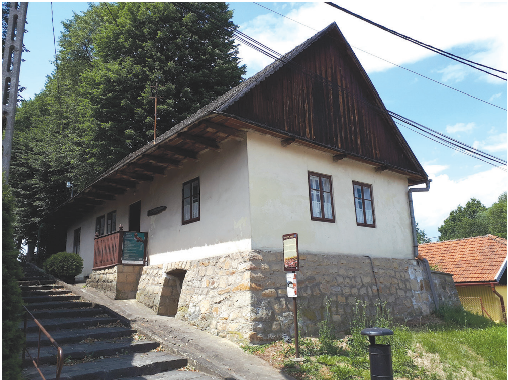
Fig. 7. View of the former school building in Lipnica Murowana nowadays