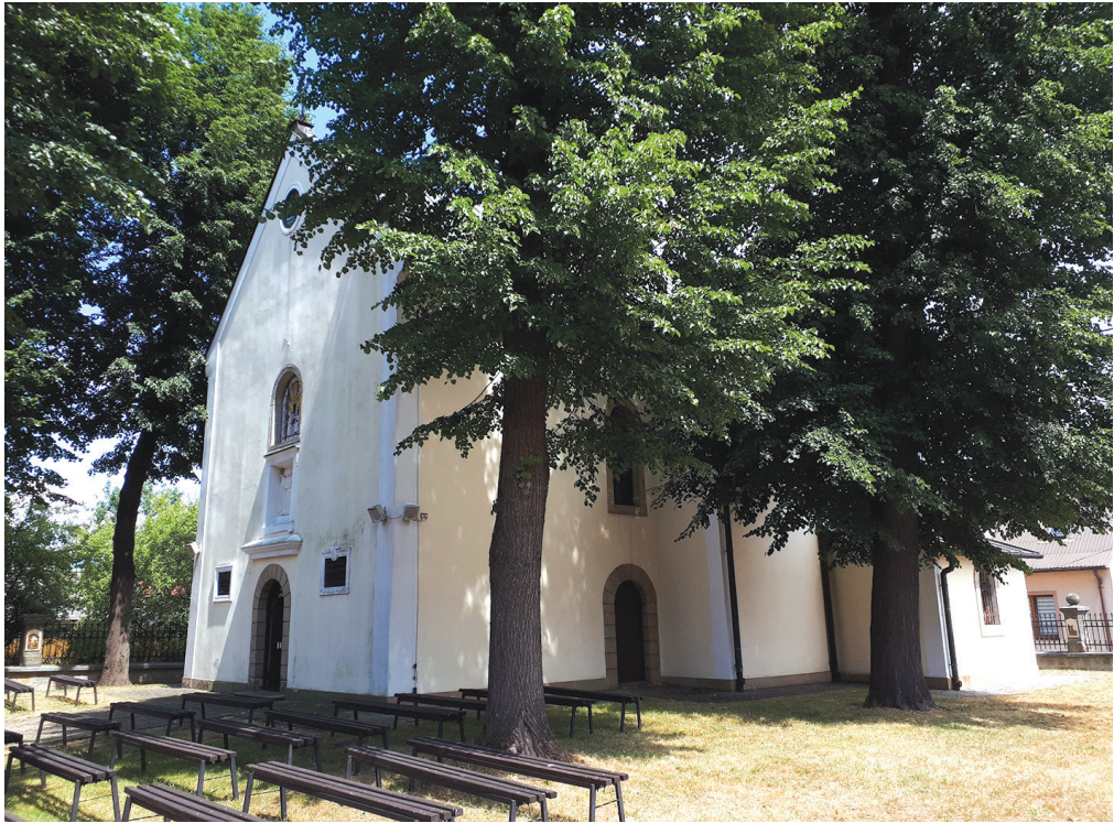
Fig. 4. View of the church of St. Simon in Lipnica Murowana nowadays

Besides church objects, there are also valuable monuments of lay architecture in Lipnica Murowana. Among these, one should mention the Starost's House, also known as the Starost's Manor. It was erected after the "Swedish deluge", probably at the turn of the 18 th century, from stones obtained from the dismantled town walls. It is a massive, masonry building with arcades. It must have served an administrative function, and was probably the seat of the town steward [...].