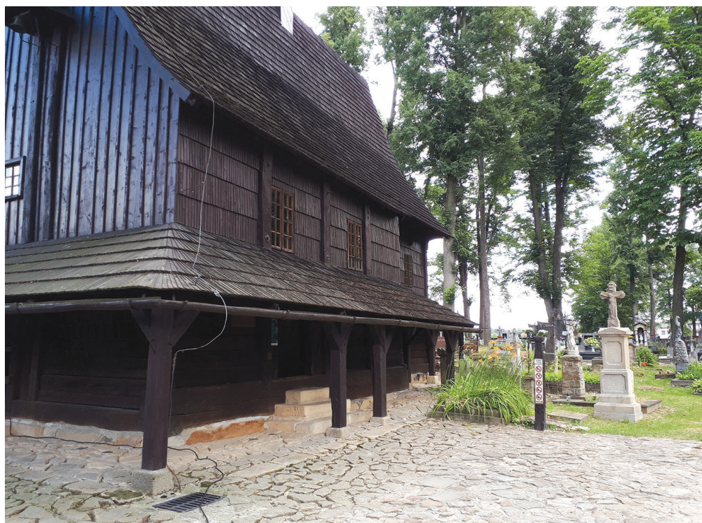
Fig. 2. View of the church of St. Leonard in Lipnica Murowana nowadays

Writing about conservation guidelines, one has to emphasise the church surroundings where the traditional forms of tombstones ought to be used, ruling out light materials such as pink marble, or not refined enough like terrazzo. Particular care should be taken of characteristic, heavy sandstone slabs, on which inscriptions and ornaments are gradually effaced by weather conditions.