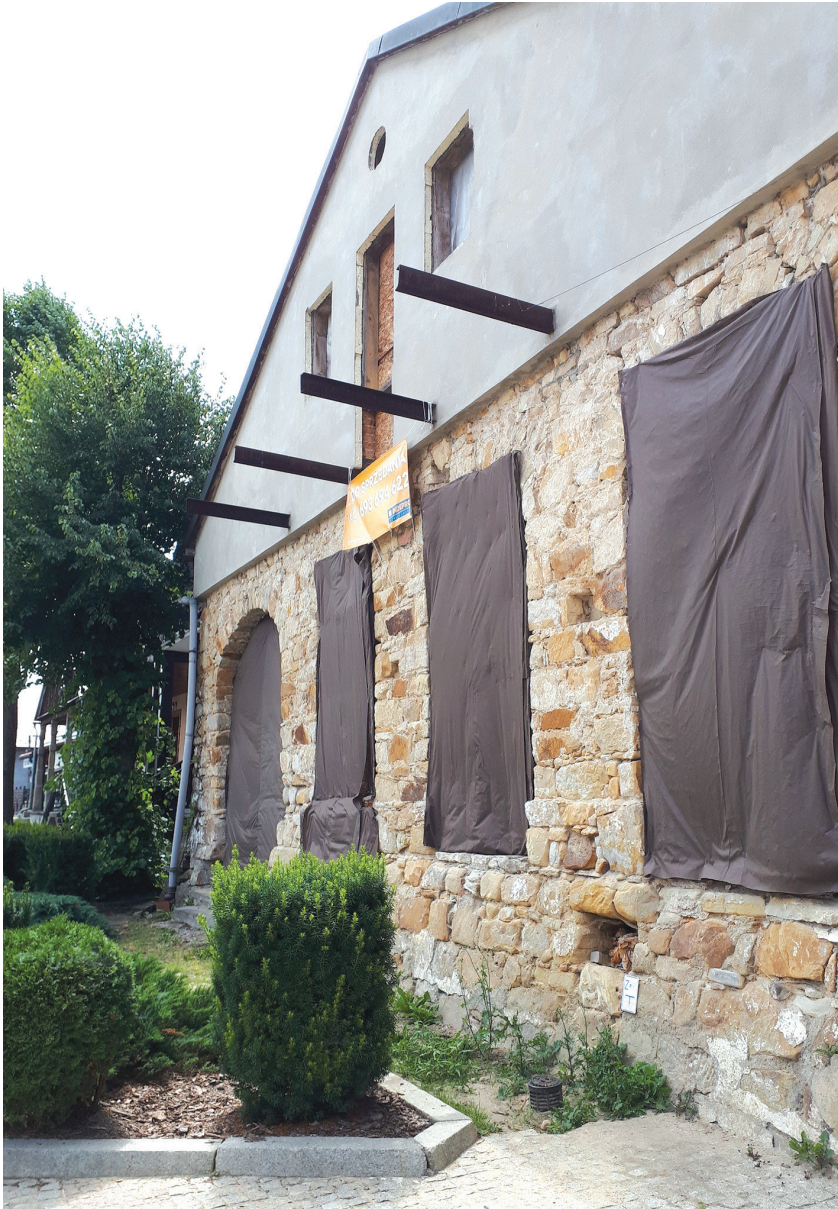
Fig. 5. View of the Starost's manor in Lipnica Murowana nowadays

The Ledóchowski Manor is listed in the voivodeship register of immovable monuments, where it was inscribed in 1976, under no A-82.