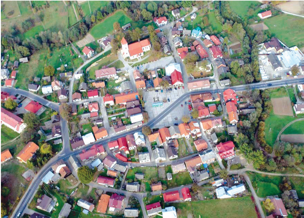
Fig. 1. Bird's-eye view of the mediaeval urban layout of Lipnica Murowana nowadays