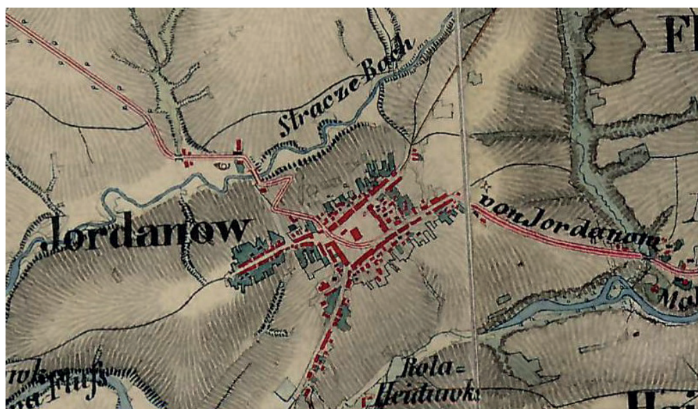
Fig. 4. Jordanów on the second military survey from 1861-1864, copy