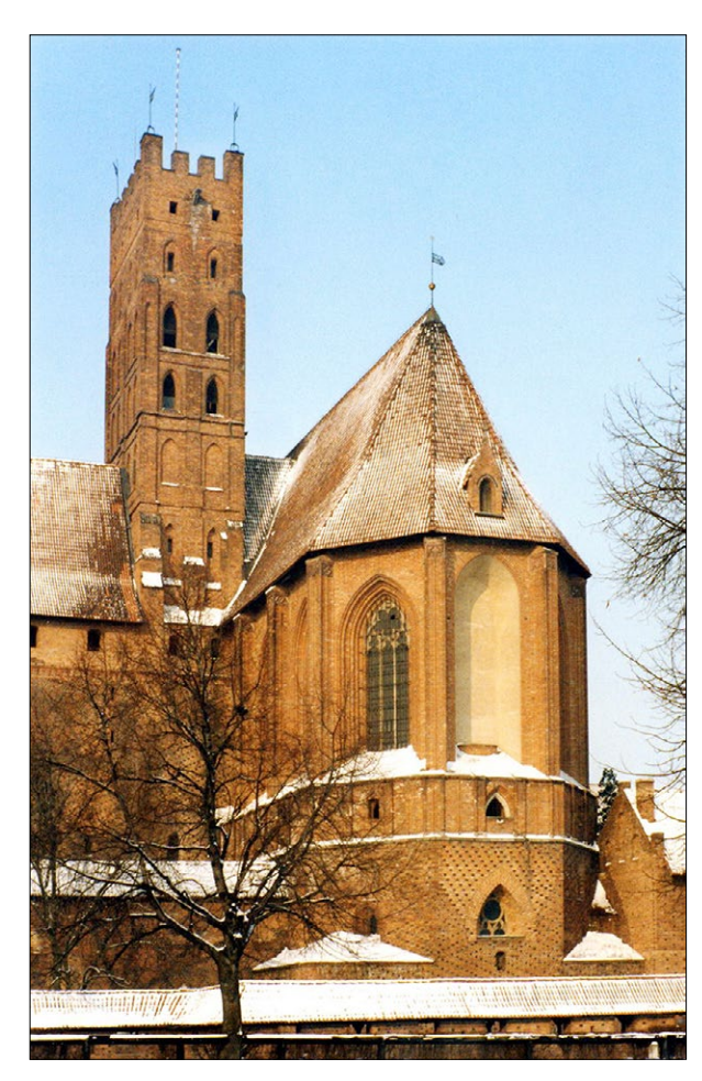
Fig. 3. The Church and the main tower after reconstruction in 1968; reprod. by L. Okoński. Ryc. 3. Kościół oraz główna wieża po odbudowie w roku 1968; reprodukcja L. Okoński.

Based on the new assumptions, in 1966, the concept of rebuilding the church itself and building a permanent roof over it was started. On the polygonal closure of the chapel, reconstructed in the years 1958–1961, the walls of the presbytery of the church were erected with four sacristies located in the thickness of the wall. After the main walls were brought out to their full height, they were fastened at the top with the preserved fragments of the former northern