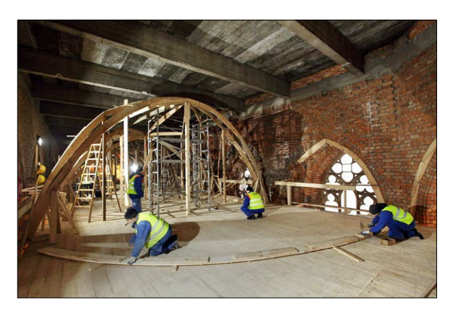
Fig. 7. Installation of centring for the reconstruction of the vault under the existing reinforced concrete ceiling, 2015; photo by L. Okoński.

Ryc. 7. Instalacja krążyn pod rekonstrukcję sklepień pod istniejącym stropem żelbetowym, 2015; fot. L. Okoński.