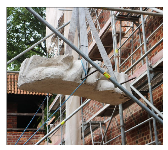
Fig. 9. Transport of the finished segments of the Madonna statue to its place in the outer niche of the presbytery, 2015; photo by L. Okoński.

Ryc. 9. Transport ukończonych segmentów figury Madonny na jej miejsce w zewnętrznej niszy prezbiterium, 2015; fot. L. Okoński.