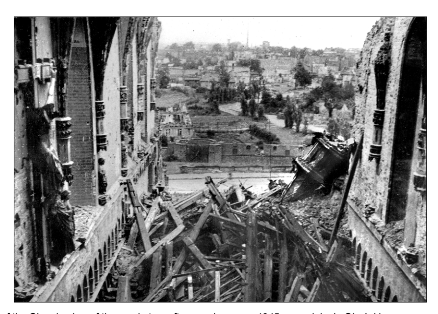
Fig. 2. The interior of the Church, view of the presbytery after war damages, 1945; reprod. by L. Okoński. Ryc. 2. Wnętrze kościoła, widok prezbiterium po uszkodzeniach wojennych, 1945; reprodukcja L. Okoński.

The remains of wooden roof trusses, hanging over the walls, threatened to collapse at any moment. Damaged roofs and broken windows made it possible to adversely affect the weather on the remnants of the surviving décor and interior equipment (Fig. 1, 2).