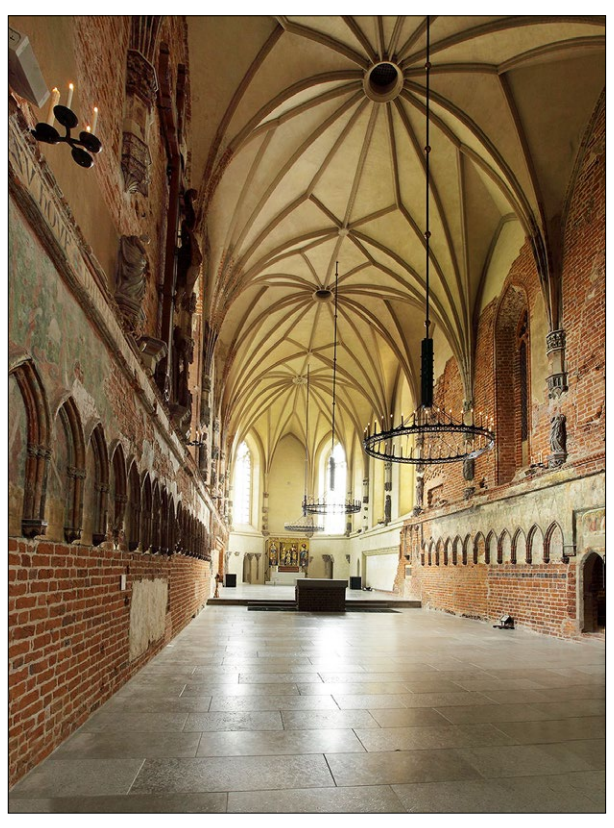
Fig. 8. Interior of the Church, view of the presbytery after the completion of the works, 2016; photo by L. Okoński. Ryc. 8. Wnętrze kościoła, widok prezbiterium po zakończeniu prac, 2016; fot. L. Okoński.

The final and one of the most difficult undertakings of the whole program was the reconstruction of the colossal figure of the Madonna with the Child in the outer niche of the church presbytery.<sup>23</sup> The very idea of recreating the figure in its former place resulted from the necessity to both restore the ideological message—resulting from its enormous importance as a symbolic, religious and architectural sign—and the restoration of aesthetic values (obtaining a new artistic