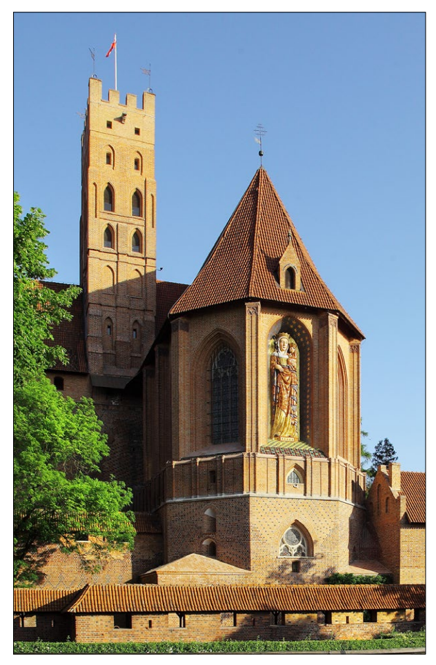
Fig. 10. View of the Church from the east, 2016; photo by L. Okoński. Ryc. 10. Widok kościoła od wschodu, 2016; fot. L. Okoński.

The final position developed by the Museum in the course of numerous discussions assumed the anastyleosis of all the preserved elements of the statue and putting them in appropriate (original) places for the figure to be re-cast in segments. The exception was the original right hand of the Madonna with fragments of the mosaic preserved in situ, which was left in the museum lapidarium for research and exhibition purposes. The remaining original fragments, excavated from the