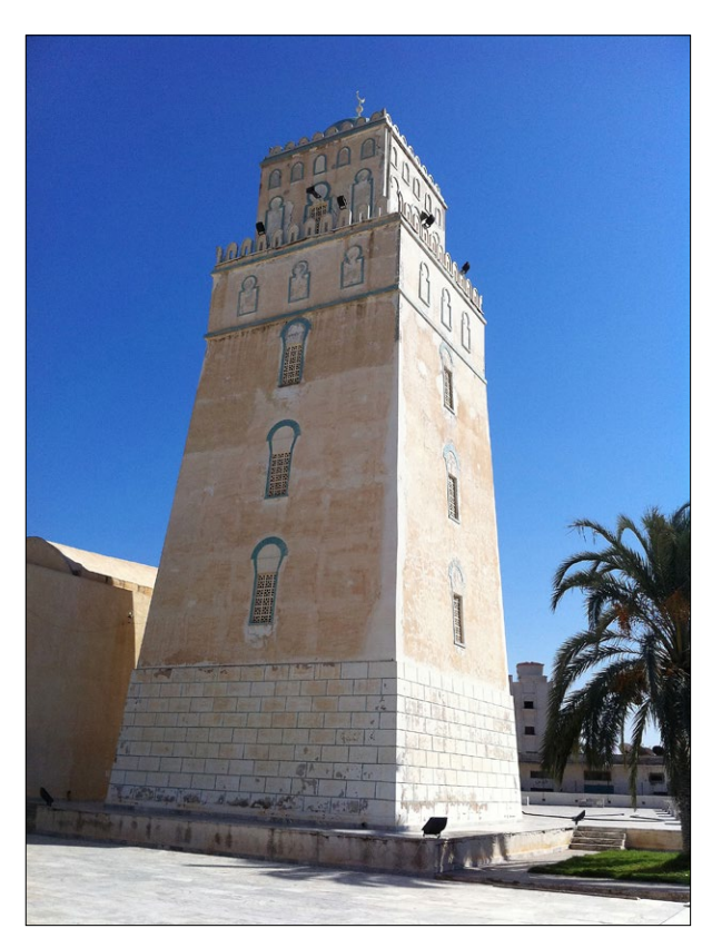
Fig. 2. Murad Agha Mosque

The Sidi Draghut Mosque is the first Ottoman mosque in Tripoli. It was built in 1561 (1560) by Darguth Pasha after his arrival as Governor of Tripoli in 1557. Previously, the site of the mosque was a Catholic church, and in accordance with Islamic tradition it was not destroyed, but made part of the mosque complex, so the complex has a non-traditional L-shaped plan, where there is a T-shaped prayer hall according to the plans of Anatolian mosques and the complex includes the former Church of the Hospitallers—a small, rectangular in plan with wooden beams that support a flat roof, to which during its transformation into part of the mosque on both sides added new masses. The reign of