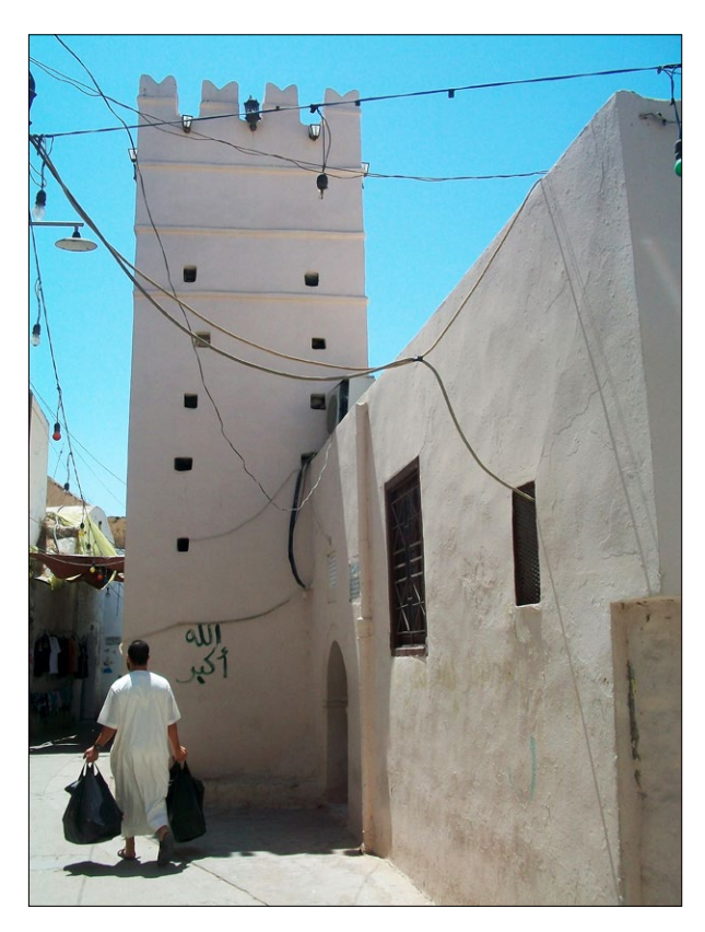
Fig. 3. Al-Naqah Mosque; source: https://upload.wikimedia.org/ wikipedia/commons/d/d9/Naga_Mosque_Exterior_Tripoli_Libya. JPG (accessed: 23 XI 2021)