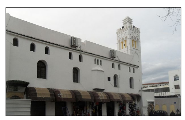
Fig. 5. Algeria, Ali Bitchin Mosque, 2018; photo by K. Rezga Ryc. 5. Algieria, meczet Alego Bicziny, 2018; fot. K. Rezga

the influence of Ottoman traditions. As for Maghreb architecture, it is too magnificent, decorated, with a large courtyard (Maghreb mosques may not have a courtyard at all), Maghreb minarets are always simple, without finishes (due to seismic conditions), the color of red brick.