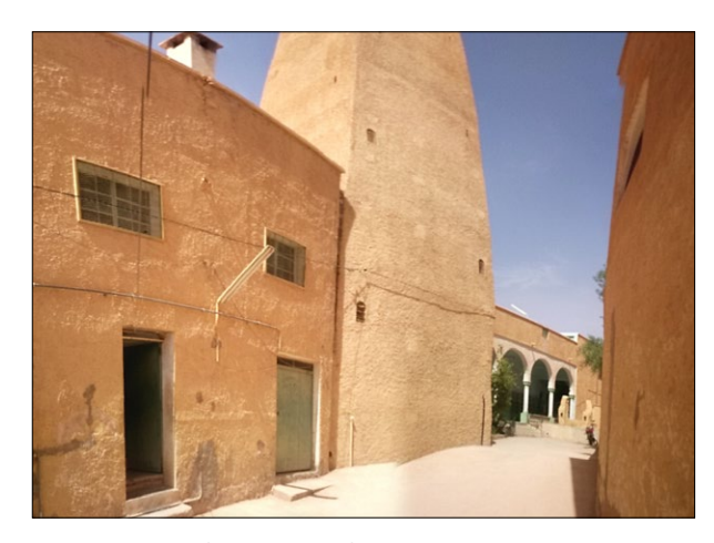
Fig. 4. Algeria. Ghardaïa. El Guerara Mosque, 2018 Ryc. 4. Algieria, Ghardaïa, meczet El Guerara, 2018

As K. Rezga notes, if we analyze the view of Ghardaïa from afar, with the ancient system of defensive walls, we can note a certain resemblance to the